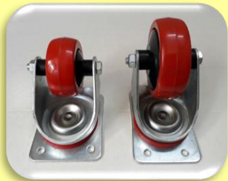
Butterfly – (B)