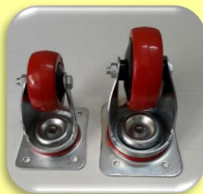
Normal – (N)